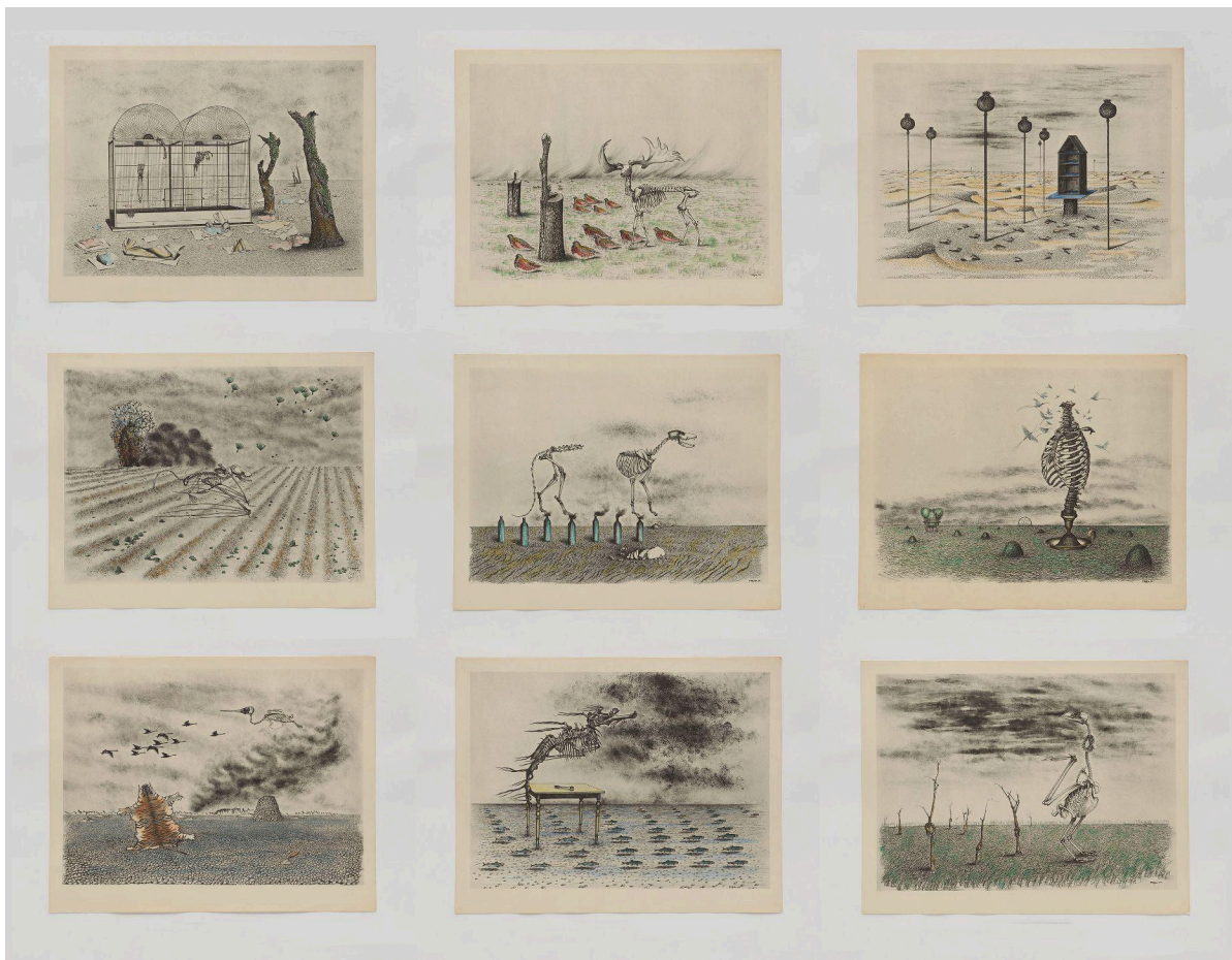
Cache-toi guerre! [Hide, War!], 1947

Richard Saltoun Gallery presents Dreaming in the Margins: The Complete Graphic Works of Toyen , the first UK exhibition dedicated to the extensive graphic production of TOYEN (1902–1980), one of the most enigmatic figures in twentieth-century Surrealism. Featuring a museum-quality collection of 78 items—including illustrated books, prints, drawings, catalogues and two original works—the exhibition offers the most complete overview of Toyen's graphic work