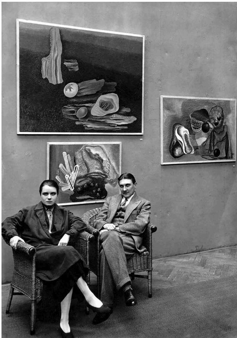
Toyen und Štyrský um 1931.